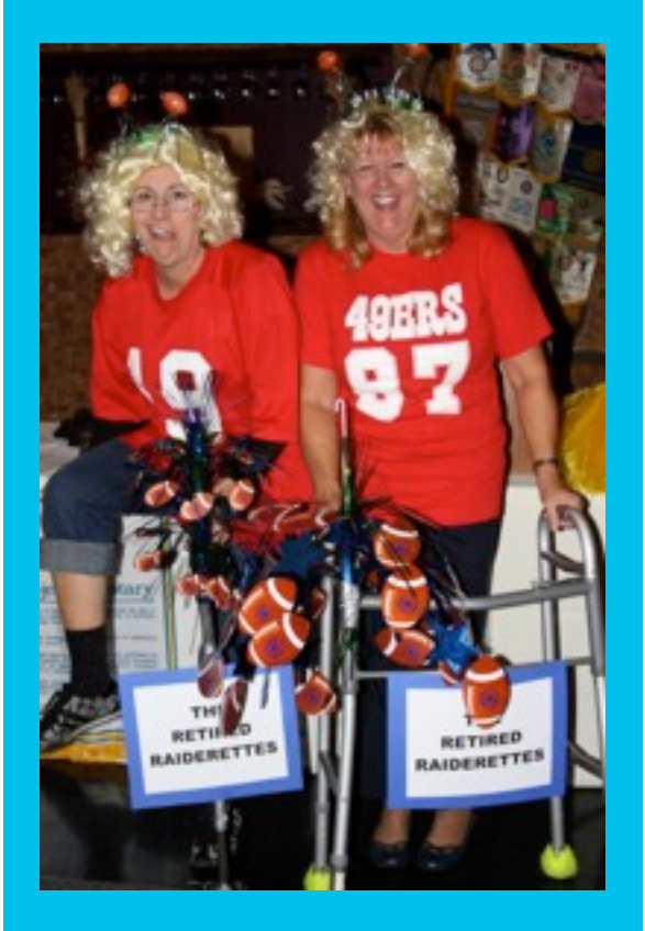
Remember the member that gets the right info may win a prize!!!